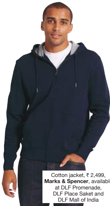
Cotton jacket, ₹ 2,499, Marks & Spencer , available at DLF Promenade, DLF Place Saket and DLF Mall of India