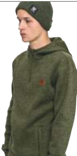
Fleece hoodie, ₹ 3,995, DC Shoes , available at DLF Promenade