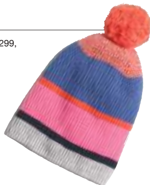
Wool beanie, ₹ 1,299, GAP , available at DLF Mall of India