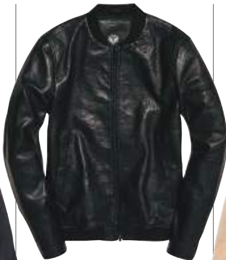
Leather bomber, ₹ 19,990, Superdry , available at DLF Mall of India