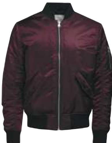
Polyester bomber, ₹ 5,499, Jack & Jones , available at DLF Mall of India and DLF Place Saket