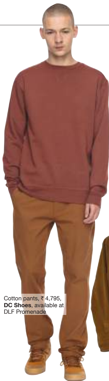
Cotton pants, ₹ 4,795, DC Shoes , available at DLF Promenade