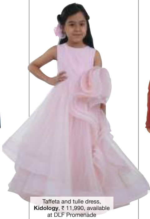
Taffeta and tulle dress, Kidology , ₹ 11,990, available at DLF Promenade