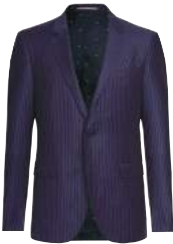
Wool jacket, price on request, Tommy Hilfiger , available at DLF Promenade and DLF Mall of India