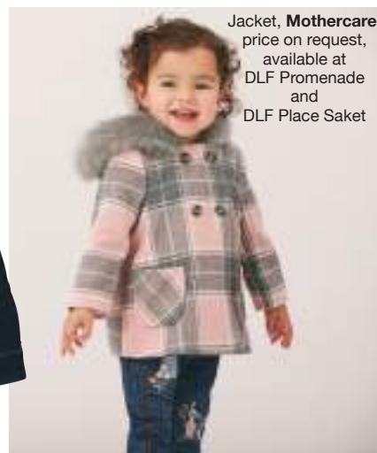
Jacket, Mothercare , price on request, available at DLF Promenade and DLF Place Saket