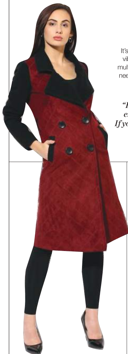
Suede coat, ₹ 5,990, Kazo , available at DLF Place Saket