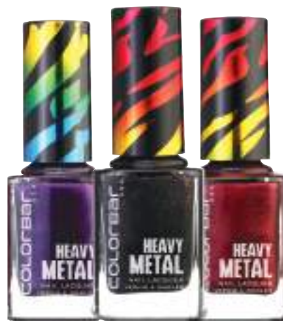
Art Effects Metallic Nail Polish, ColorBar , ₹ 300, available at DLF Promenade, DLF Mall of India and DLF Place Saket