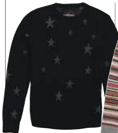
Jacquard sweater, ₹ 4,990, Superdry , available at DLF Mall of India