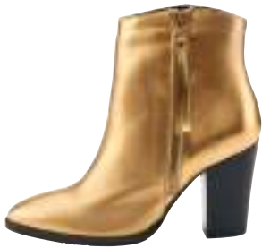
Metallic leather boots, price on request, Tommy Hilfiger , available at DLF Promenade and DLF Mall of India

Nostalgia plays a vital role in determining a season's trends. I find that the world—the fashion fraternity, in particular—dips into its collective consciousness to create ideas that speak to a wide audience. And because what affects people invariably affects the fashion of the time, the rules of dressing for winter are heavily influenced by what's happening around us. Here's my cheat sheet of all the important upgrades for your wardrobe: