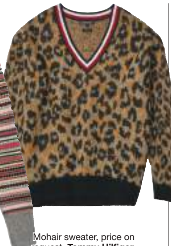
Mohair sweater, price on request, Tommy Hilfiger , available at DLF Promenade and DLF Mall of India