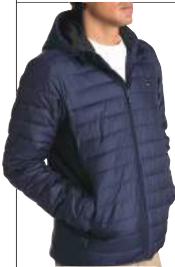
Polyester puffer jacket, ₹ 5,995, Quiksilver , available at DLF Mall of India

It's quite ironic to subscribe to this trend, I think—you choose to rebel by falling victim to the capitalist. But don't let that thought stop you. Find a printed satin bomber, an embellished DIY denim jacket, lots of T-shirts with logos, slogans, embroidery and prints, and roll with it.