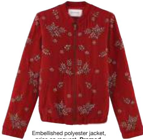
Embellished polyester jacket, price on request, Promod , available at DLF Promenade and DLF Mall of India