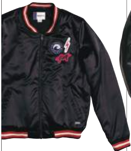
Polyester bomber, ₹ 7,995, Roxy , available at DLF Mall of India