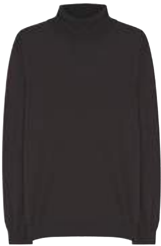
Wool-blend sweater, ₹ 5,490, Massimo Dutti , available at DLF Mall of India