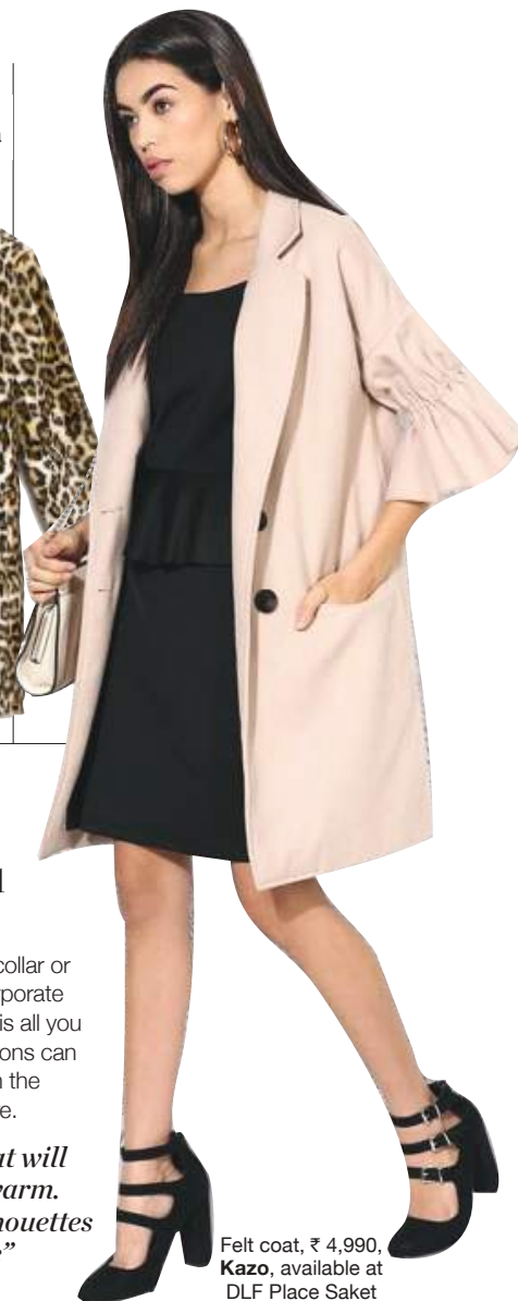
Felt coat, ₹ 4,990, Kazo , available at DLF Place Saket