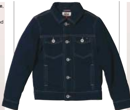
Denim jacket, Tommy Hilfiger , price on request, available at DLF Promenade and DLF Mall of India