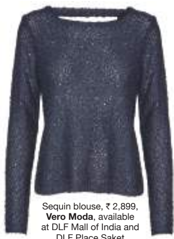
Sequin blouse, ₹ 2,899, Vero Moda , available at DLF Mall of India and DLF Place Saket