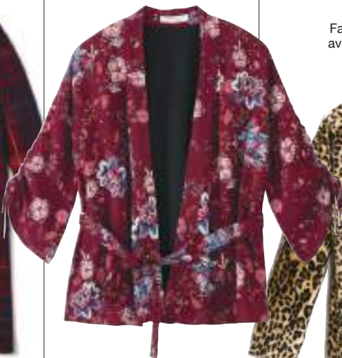
Viscose jacket, ₹ 5,990, Promod , available at DLF Promenade and DLF Mall of India