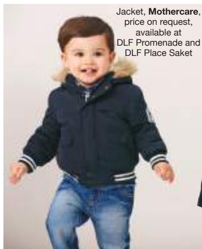
Jacket, Mothercare , price on request, available at DLF Promenade and DLF Place Saket