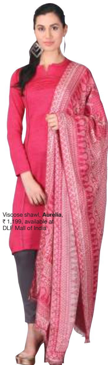
Viscose shawl, Aurelia , ₹ 1,199, available at DLF Mall of India

This winter, scarves, shawls and beanies are the only accessories you'll need to stay toasty and comfortable. Pick up a scarf in a bright colour to add cheer to otherwise formal outfits, or step out with a beanie that is both practical and perfect for those spur-of-the-moment late-night outings.