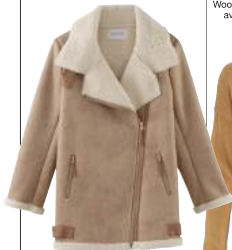
Faux sheepskin coat, ₹ 9,990, Promod , available at DLF Promenade and DLF Mall of India