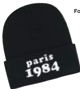
Acrylic beanie, ₹ 999, Forever 21 , available at DLF Promenade, DLF Place Saket and DLF Mall of India