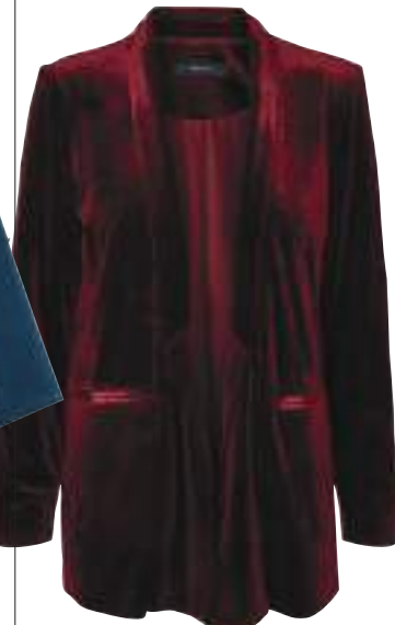
Velvet coat, ₹ 4,299, Vero Moda , available at DLF Mall of India and DLF Place Saket