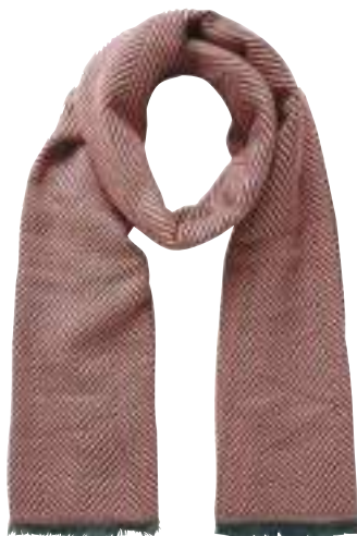
Acrylic scarf, Vero Moda , ₹ 1,499, available at DLF Mall of India, DLF Place Saket and DLF City Centre (Chandigarh)