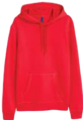
Cotton-polyester sweatshirt, ₹ 1,799, H&M , available at DLF Mall of India