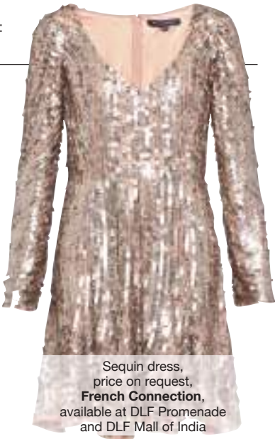
Sequin dress, price on request, French Connection , available at DLF Promenade and DLF Mall of India