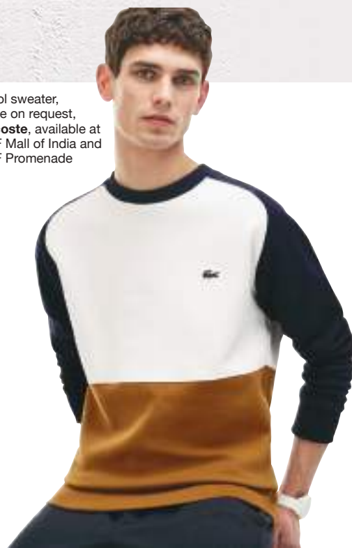
Wool sweater, price on request, Lacoste , available at DLF Mall of India and DLF Promenade