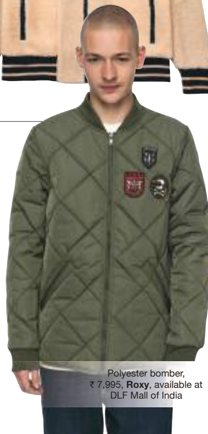
Polyester bomber, ₹ 7,995, Roxy , available at DLF Mall of India