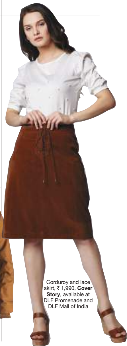
Corduroy and lace skirt, ₹ 1,990, Cover Story , available at DLF Promenade and DLF Mall of India