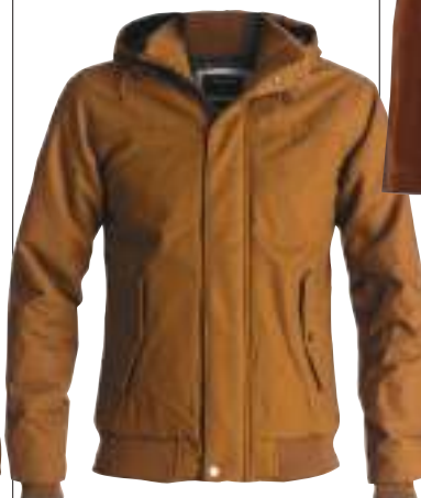
Cotton canvas jacket, ₹ 8,995, Quiksilver , available at DLF Mall of India