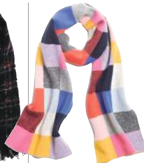
Wool-blend scarf, ₹ 1,999, GAP , available at DLF Mall of India