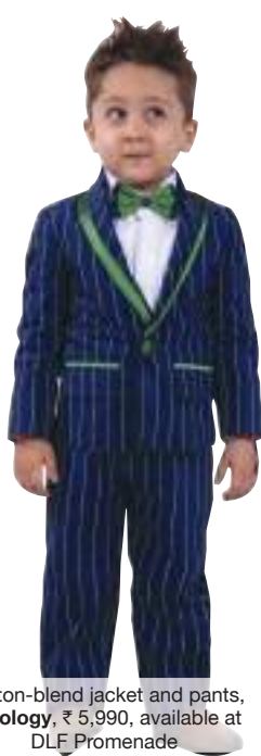
Cotton-blend jacket and pants, Kidology , ₹ 5,990, available at DLF Promenade