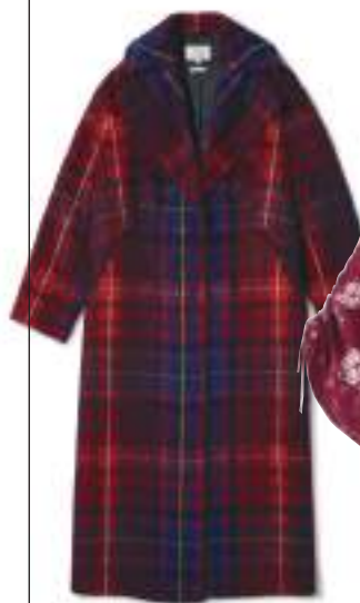
Wool coat, ₹ 38,000 approx., TOMMYXGIGI by Tommy Hilfiger , available at DLF Promenade and DLF Mall of India