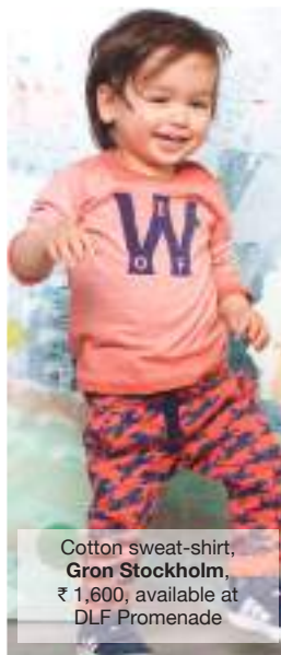
Cotton sweat-shirt, Gron Stockholm , ₹ 1,600, available at DLF Promenade