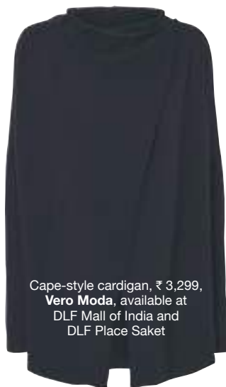
Cape-style cardigan, ₹ 3,299, Vero Moda , available at DLF Mall of India and DLF Place Saket