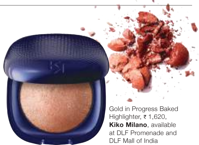
Gold in Progress Baked Highlighter, ₹ 1,620, Kiko Milano , available at DLF Promenade and DLF Mall of India