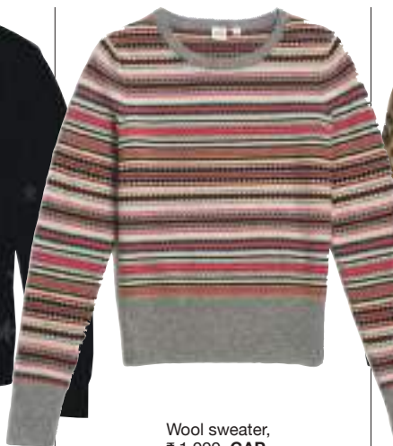
Wool sweater, ₹ 1,999, GAP , available at DLF Mall of India