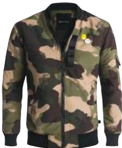
Nylon bomber, ₹ 9,995, Quiksilver , available at DLF Mall of India