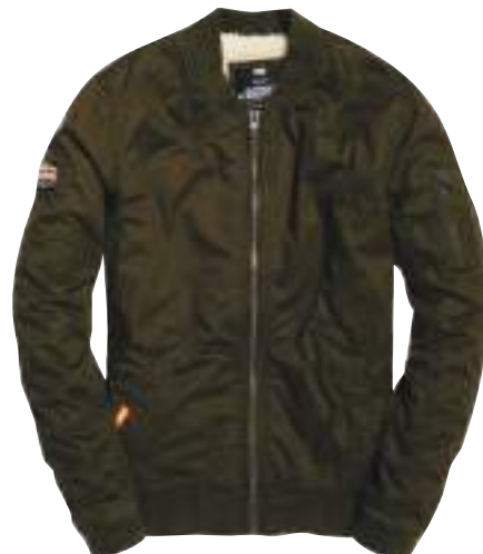
Cotton and polyester bomber, ₹ 9,990, Superdry , available at DLF Mall of India