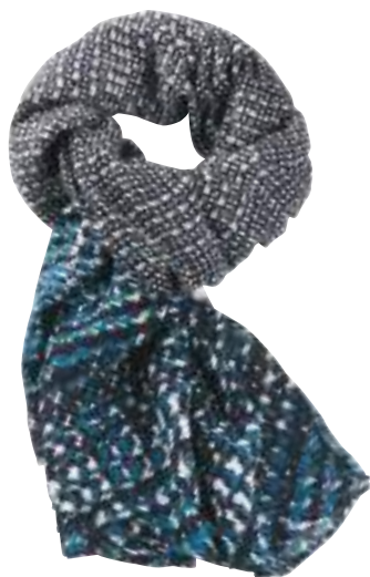
Viscose scarf, ₹ 4,399, Kipling , available at DLF Promenade and DLF Place Saket