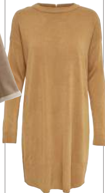
Wool coat, ₹ 7,299, Vero Moda , available at DLF Mall of India and DLF Place Saket