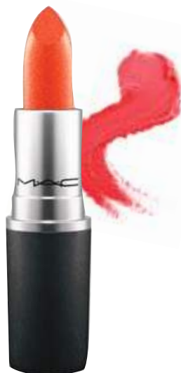
Optix Metallic Lipstick, ₹ 1,650, M.A.C. , available at DLF Promenade, DLF Mall of India and DLF Place Saket