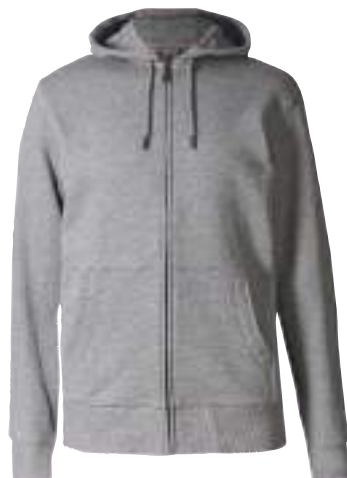
Cotton jacket, ₹ 2,499, Marks & Spencer , available at DLF Promenade, DLF Place Saket and DLF Mall of India