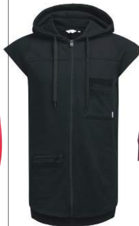
Cotton jacket, 2,999, Jack & Jones , available at DLF Place Saket and DLF Mall of India