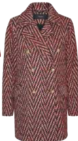
Polyester coat, ₹ 5,299, Vero Moda , available at DLF Mall of India and DLF Place Saket