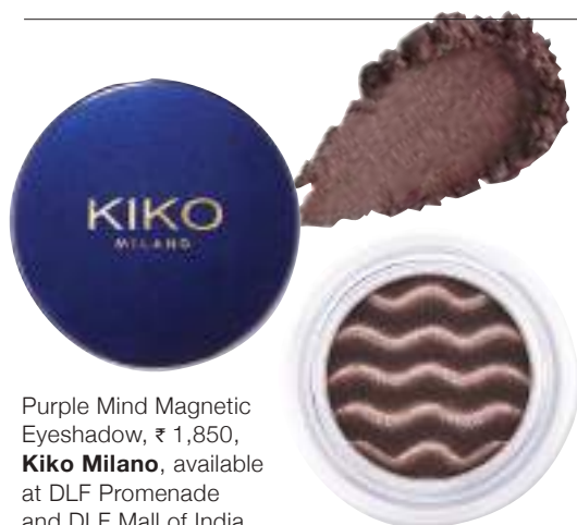
Purple Mind Magnetic Eyeshadow, ₹ 1,850, Kiko Milano , available at DLF Promenade and DLF Mall of India

Remember the shimmery lipstick of the '90s? Well, she's back, she's better than ever and she's brought all her friends to town. Metallic make-up, the most dominant beauty trend this season is vibrant and fearless. Metallic lip liners give your lips that beautiful chrome finish without the blinding shine, making them perfect for both work and play. Experiment with shimmery eyeshadow to give your smoky eye a dramatic upgrade, or use a golden highlighter to really put your cheekbones in the spotlight. Here's our pick of the best metallic make-up: