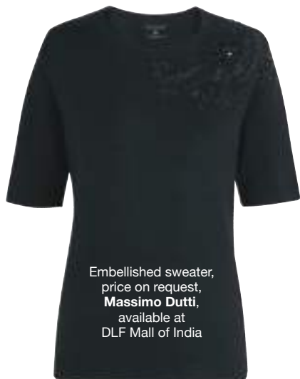
Embellished sweater, price on request, Massimo Dutti , available at DLF Mall of India