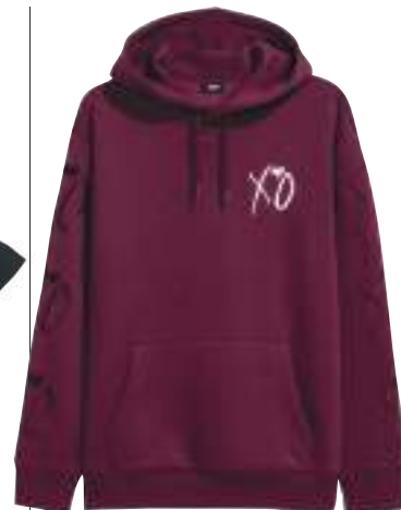
Cotton-polyester sweatshirt, ₹ 2,699, H&M , available at DLF Mall of India