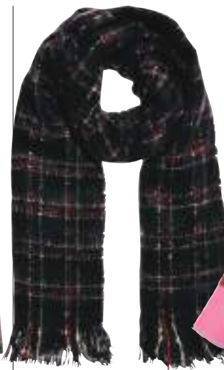
Acrylic scarf, ₹ 2,990, Superdry , available at DLF Mall of India