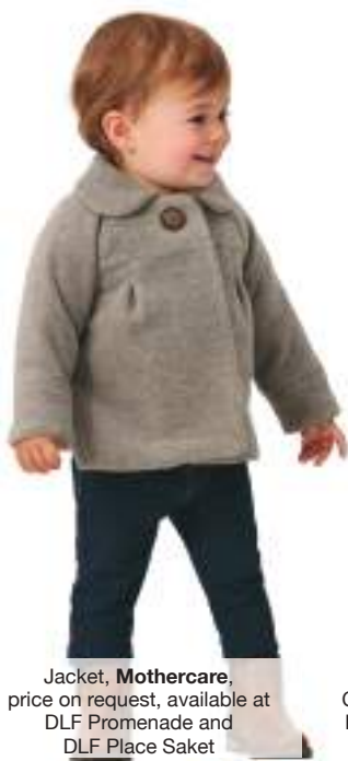
Jacket, Mothercare , price on request, available at DLF Promenade and DLF Place Saket