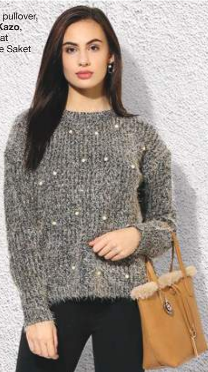
Polyester pullover, ₹ 2,490, Kazo , available at DLF Place Saket