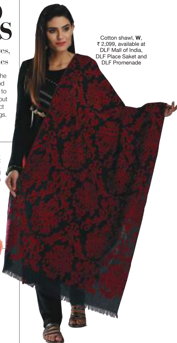
Cotton shawl, W , ₹ 2,099, available at DLF Mall of India, DLF Place Saket and DLF Promenade