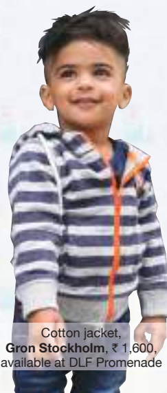
Cotton jacket, Gron Stockholm , ₹ 1,600, available at DLF Promenade