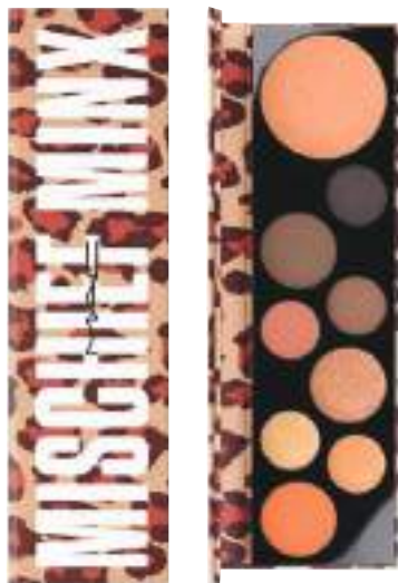
Mischief Minx Eye Palette, ₹ 4,200, M.A.C. , available at DLF Promenade, DLF Mall of India and DLF Place Saket