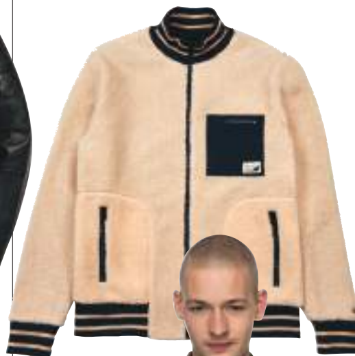
Fleece bomber, price on request, Tommy Hilfiger , available at DLF Promenade and DLF Mall of India