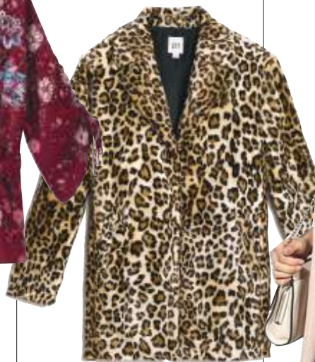
Faux fur coat, ₹ 5,999, GAP , available at DLF Mall of India