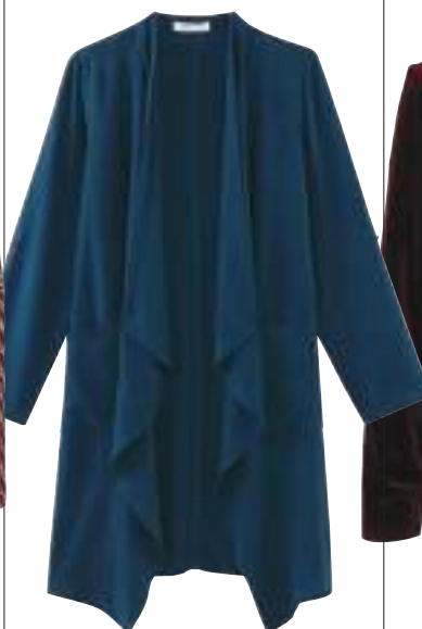
Viscose cover-up, ₹ 4,490, Promod , available at DLF Promenade and DLF Mall of India