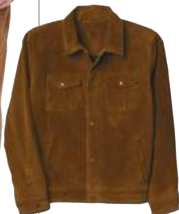
Suede jacket, ₹ 6,999, GAP , available at DLF Mall of India