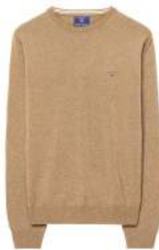
Superfine lambswool sweater, ₹ 8,999, Gant , available at DLF Mall of India