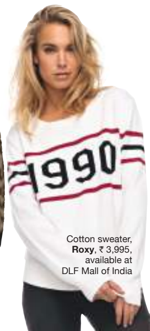
Cotton sweater, Roxy , ₹ 3,995, available at DLF Mall of India