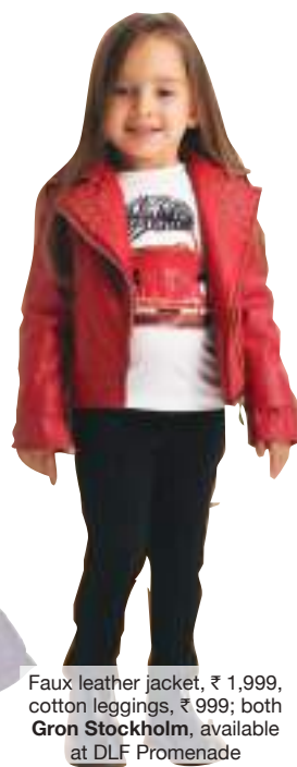
Faux leather jacket, ₹ 1,999, cotton leggings, ₹ 999; both Gron Stockholm , available at DLF Promenade